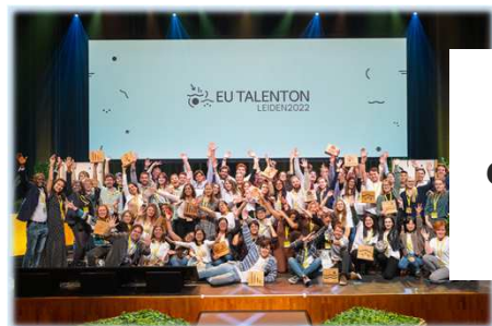
European Union Contest for early-career researchers: EU TalentOn 2026