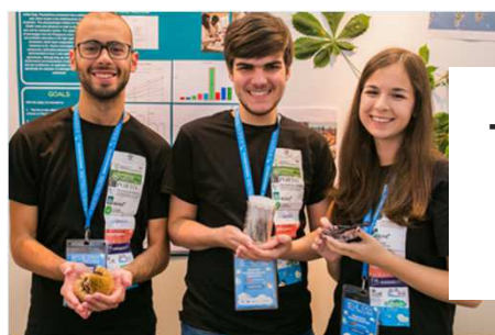
The European Union Contest for Young Scientists: EUCYS 2026