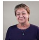
Chryssa KOUVELIOTOU (High-Energy Astrophysics)