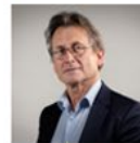
Ben FERINGA (Organic Chemistry)