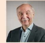
Gerd GIGERENZER (Psychology)