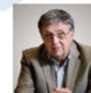
László LOVÁSZ (Mathematics)